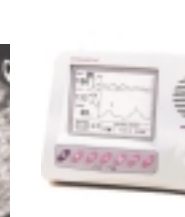
47. Analogic Electronics