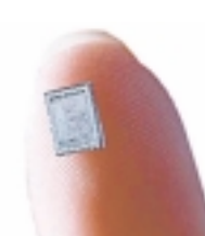
81. Genrad Electronics