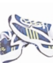
84. Stride Rite Consumer goods