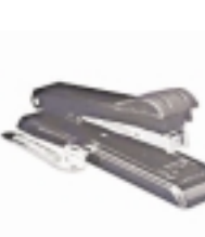
71. Staples Retail