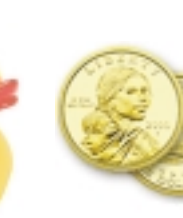
88. Medford Bancorp Banking