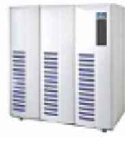
4. EMC Technology