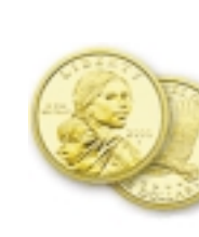
66. Capital Crossing Banking