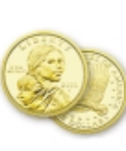
64. Metrowest Banking