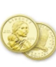
74. First Essex Banking