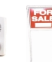
48. DeWolfe Financial