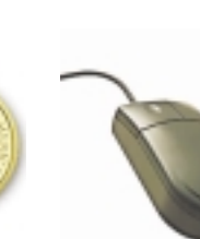
78. Netscout Technology