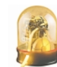
26. Investors Financial Financial