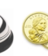
90. Andover Bancorp Banking