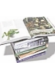
44. Courier Services