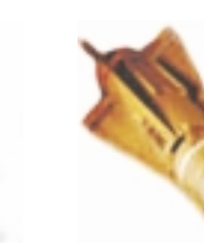
69. Raytheon Electronics