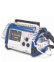
52. Zoll Medical Health care