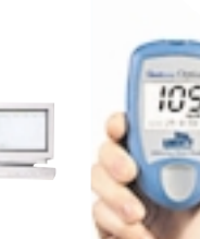
20. PolyMedica Health care