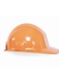
11. Perini Services