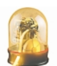
91. Affiliated Managers Financial