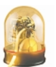
43. State Street Financial