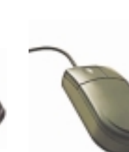
97. Kronos Technology