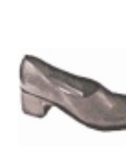
96. Maxwell Shoe Consumer goods