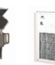
60. Thermo Electron Manufacturing