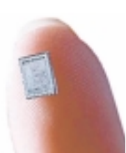
63. Lo-Jack Electronics