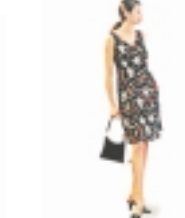
27. TJX Retail