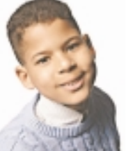
53. Bright Horizons Services