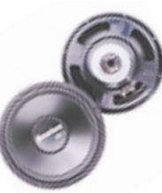
94. Boston Acoustics Manufacturing