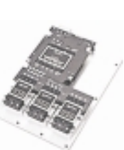
33. Vicor Manufacturing