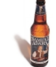
76. Boston Beer Consumer goods