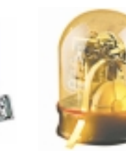
18. Eaton Vance Financial