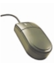
12. Centennial Technology