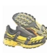
35. Reebok Consumer goods