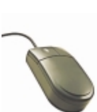
62. Progress Software Technology