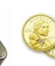
79. Independent Bank Banking