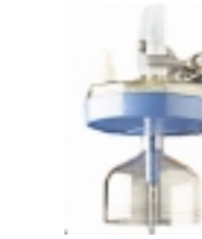
7. Millipore Manufacturing