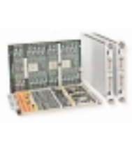
1. Teradyne Electronics