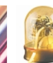
58. Commerce Group Financial