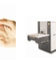
30. BTU Electronics