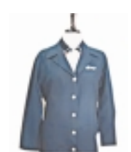
72. Unifirst Manufacturing