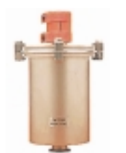
13. MKS Instruments Electronics