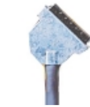
6. ACT Manufacturing