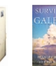
50. Houghton Mifflin Services