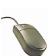
82. Eprence Technology