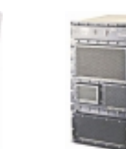
49. Mercury Computer Electronics