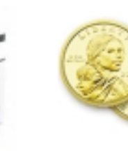
10. FleetBoston Banking