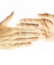
54. N.E. Business Services Services