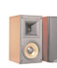
36. Tweeter Retail