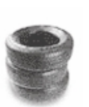
23. BJ's Wholesale Retail