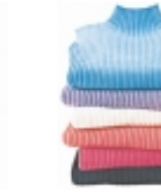
8. Talbots Retail