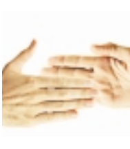
42. Sapient Services