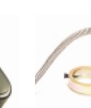
99. SLI Manufacturing