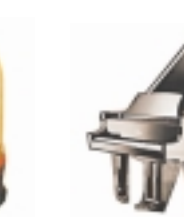
59. Steinway Consumer goods