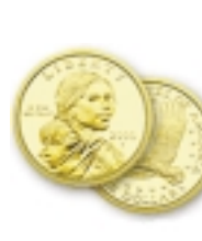
65. Boston Private Financial Banking