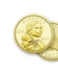
77. Century Bancorp Banking