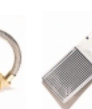
100. Parlex Manufacturing