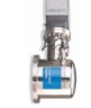
5. Helix Electronics