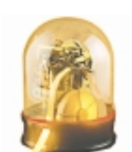
92. Allmerica Financial