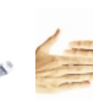
29. Forrester Research Services