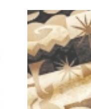
38. Quaker Fabric Manufacturing