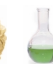
68. Genzyme Biotechnology