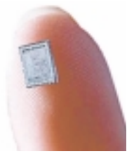
3. LTX Electronics