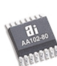
32. Alpha Electronics