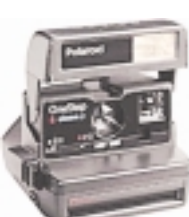
51. Polaroid Consumer goods