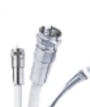
85. Brooktrout Telecommunications