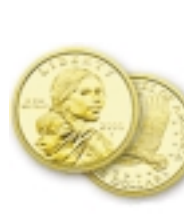
95. Peoples Bancshares Banking