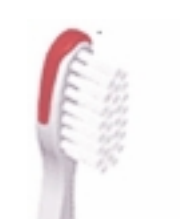
73. American Dental Health care