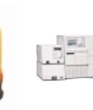
19. Waters Electronics