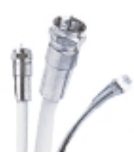
2. Analog Devices Electronics