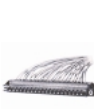
61. PCD Manufacturing