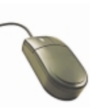
34. RSA Security Technology