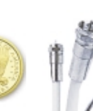
80. Lifeline Systems Telecommunications