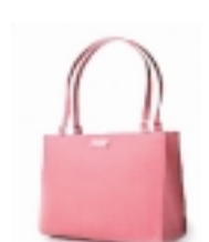
31. Neiman Marcus Retail