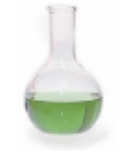
14. Biogen Biotechnology