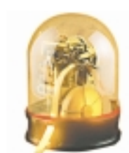
25. Microfinancial Financial