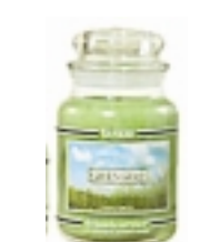
22. Yankee Candle Consumer goods