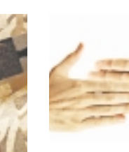
39. Lightbridge Services