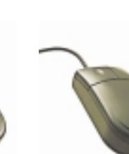
98. CSP Technology