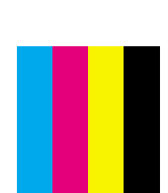
41. Cabot Manufacturing