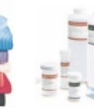
9. Cytac Health care