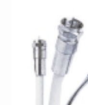
28. Aware Technology