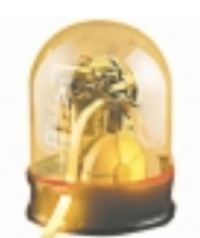
24. Tucker Anthony Sutro Financial