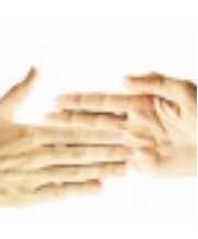
83. Charles River Associates Services