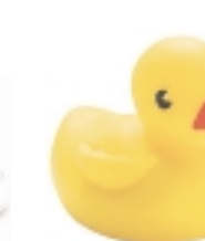
87. First Years Consumer goods