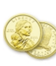
75. CCBT Financial Banking