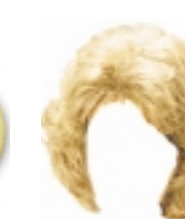
67. Specialty Catalog Retail