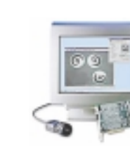
17. Cognex Manufacturing