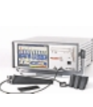
21. Matec Manufacturing