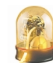
56. Liberty Financial Financial