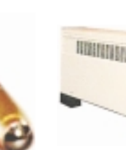
70. Mestek Manufacturing