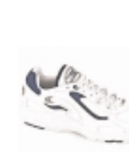
86. Saucony Consumer goods