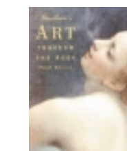
16. Harcourt Services