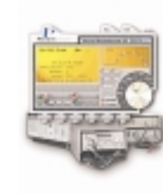
15. PerkinElmer Electronics