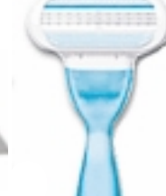
45. Gillette Consumer goods