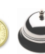
89. Sonesta Retail