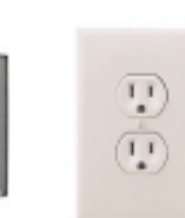
37. NStar Services